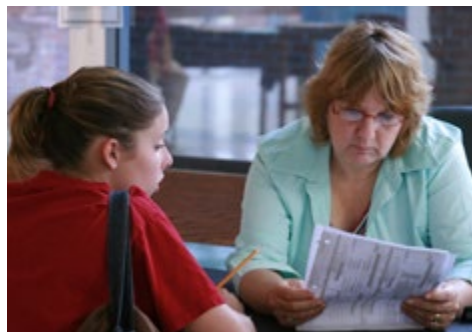
Scheduling classes for the year