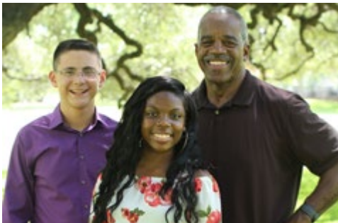
Time with staff

You are empowered to resolve your grievances prior to completing a Special Request for Assistance (SRA) form. When this is not possible or a resolution is unable to be made without further assistance, you are asked to describe how you feel your rights have been violated on the Special Request for Assistance form. SRA forms are posted for easy student access at all times. The forms are also available in your home unit through your caseworker, unit manager or other staff members. You may turn them in to any childcare worker or staff member, or place them in one of our many drop boxes. If concerned, parents or managing conservators may also speak directly to a unit manager or administrator.