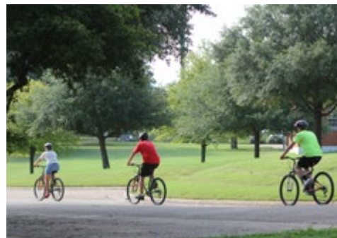
Enjoying the beautiful campus