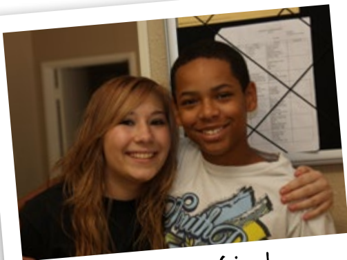
Making new friends

The Steps to Success program is designed to help students learn to appropriately give care, receive care, develop autonomy and negotiate with others. As students move through the program, the need for direct supervision is reduced and students are given more opportunities for independent activities. The level of supervision provided at any step may be adjusted for an individual student whenever necessary.